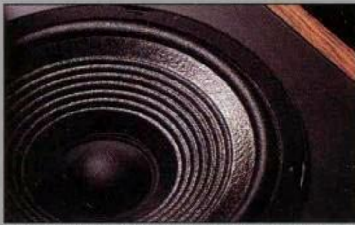
Laminated high polymer woofers and midrange drivers bring us one step closer to the ideal of a light, rigid piston.

All JBL TLX Loudspeakers employ a dome tweeter laminated with vapor deposited titanium. Titanium is one of the lightest, stiffest materials known to man, and makes our TLX tweeter one of the lightest and stiffest ever made. It has the structural integrity of a "hard" dome, and the damping characteristics of a traditional soft dome. There's virtually no break-up, no roughness. There's lower distortion, and extended smooth frequency response. A unique clear phasing ellipse is an integral part of the design. It aids in flattening the high frequency response by shadowing the center of the dome of the tweeter.