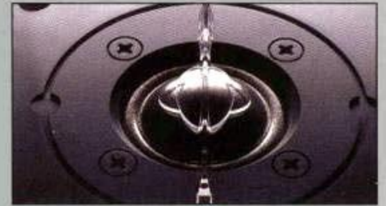
Vapor deposited titanium coats the dome of our new tweeter, making it one of the lightest and stiffest available.

designs, experts in magnetic circuitry and cabinet structure, all contributed to the final product, the TLX Series: rich, smooth-sounding, highly efficient, rugged loudspeakers that combine so many virtues they can perhaps best be summarized as "beautifully balanced."